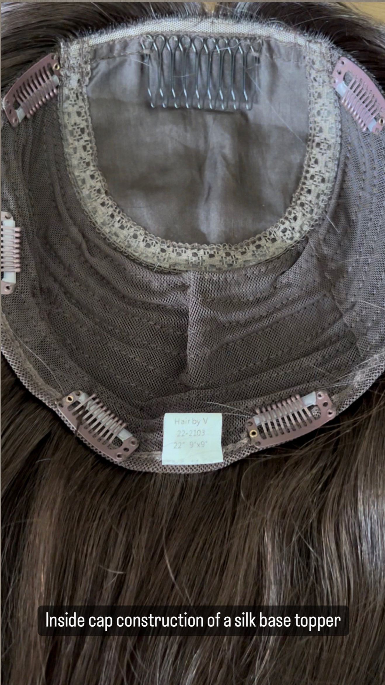
Inside cap construction of a silk base topper